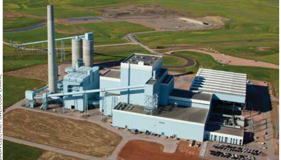
MOVING TOWARD THE FUTURE: Electric cooperatives will help lead research into removing greenhouse gas from coal plant emissions with a research station now being built next to this Basin Electric Power Cooperative plant in Wyoming.

In addition to Basin Electric’s involvement, financial support comes from Denver-based Tri-State Generation and Transmission Association and the National Rural Electric Cooperative Association. The state of Wyoming has been the main funder and organizer of the test center, and another key partner is the X Prize Foundation.